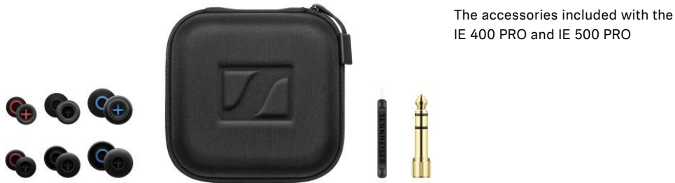
The accessories included with the IE 400 PRO and IE 500 PRO

cable duct that sits the cable's sturdy anti-kink sleeve directly on the ear mould to provide a long-lasting solution for the rigors of stage use.